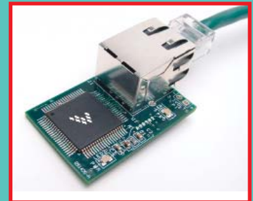
Fully functional Web server (AN2759)